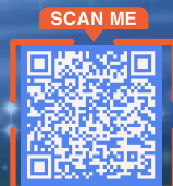
For more details

Modeled after President Kennedy's 1960 U.S. Presidential Physical Fitness Challenge. This is a fun 10 day exercise challenge 100% accessible by teachers online to keep students moving and active. Students are challenged to complete daily activities and track their progress in the following areas: